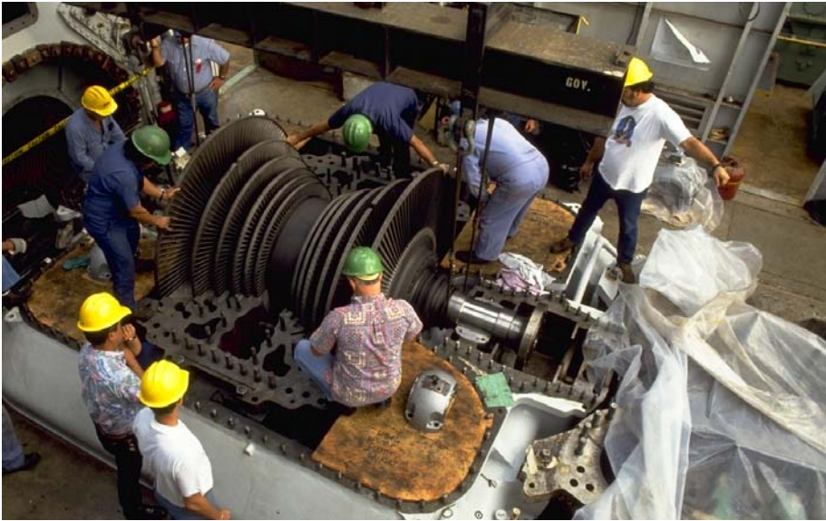
Turbine overhaul, Kahe Power Plant